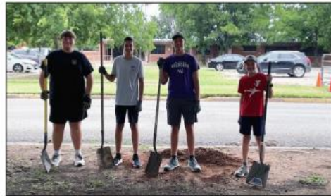
The church volunteers picked up debris and planted flowers near the chapel.